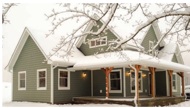
The Cold Weather Rule helps existing consumer-members maintain electric services during the winter.

Rolling Hills Electric will send written notice to consumermembers 10 days before disconnection, plus will call by phone or make personal contact the day before.